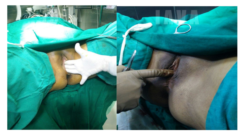
Fig. 3 Vaginal tightening—pre-op and immediate post-op

Non-surgical devices such as radiofrequency and lasers have been reported to be extremely effective in achieving significant vaginal tightening as well as enhancing lubrication after therapy [13]. These options are currently being