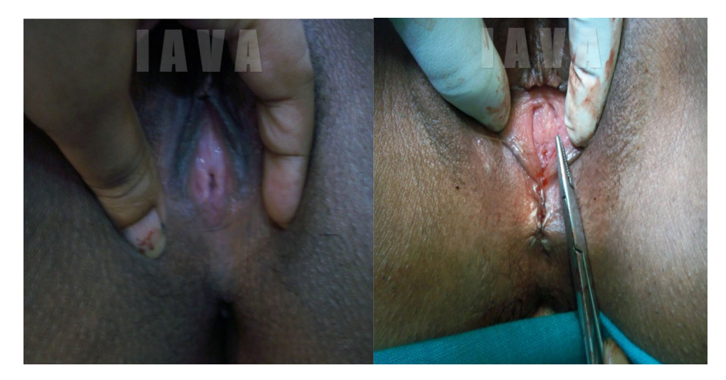
Fig. 4 Hymenoplasty—pre-op and intra-op after reconstruction

explored by the primary author to assess their efficacy as vaginal rejuvenation modality by themselves and as an adjuvant technique.